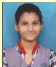
Swoni Cul. Act.