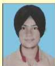
Paramvir Cul. Act.